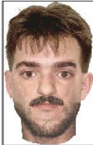
Computer Generated Composite from LPD 03-55821